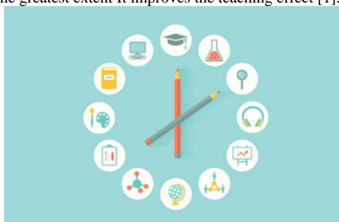
Fig.2 Main Features of Micro Courses

Moreover, the teaching content of the video is very concise and the topic is relatively clear, and it can break the restrictions of teaching space and teaching time, and focus on a certain knowledge point. Students can also watch and learn repeatedly according to the knowledge points they don't have, until they have a full grasp of the position of the knowledge points, which saves the time of classroom teaching to the greatest extent It improves the teaching effect [1]. As shown in the figure: