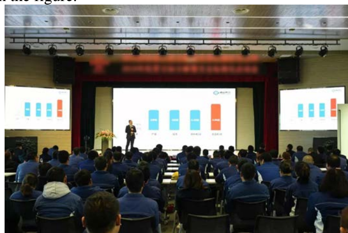
Fig.3 Teaching Objectives

In the face of more and more complex and comprehensive demand for talents and high-intensity competition in the talent market, in order to improve the employment competitiveness of college students, we must strengthen the cultivation of students' comprehensive quality and technical ability. College computer foundation is the information technology literacy that students must have. Therefore, in the teaching of Computer Science in Colleges and universities, the application of micro course teaching can decompose and refine the theoretical teaching and practical teaching content, and make it a complete system to realize the decomposition of the teaching objectives of the system, as shown in the figure: